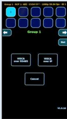
PS Protocol Select