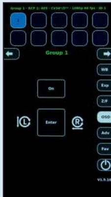
OSD On Screen Display