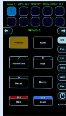
WS White Balance