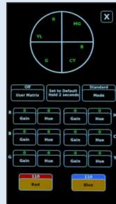
MA Matrix Adjustment