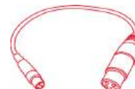
Mini XLR to XLR