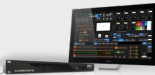
CARBONITE BLACK SOLO FRAME 1RU Production Switcher with VirtualPanel