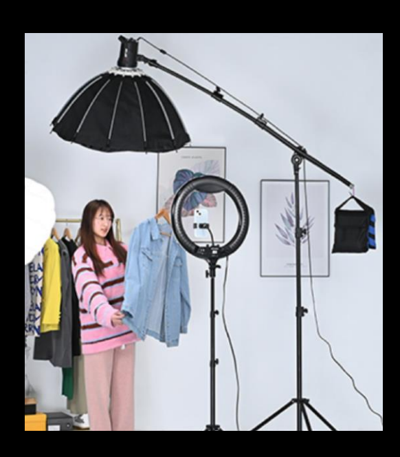
XX Brand 150W---Integrated Power Design

Hard to control on high stands Adapter becomes burden