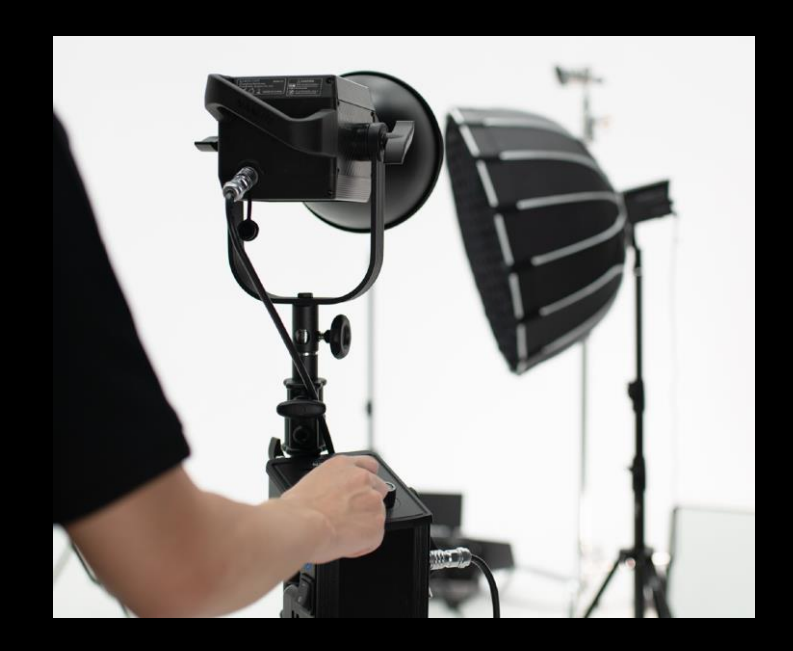
XX Brand 150W---Separate Control Design

The G300 adopts the more expensive separate control design typically only seen on high-end pro video lights, integrating the controller with the power supply to take advantage of the hanging space and ease adjustment when up on high stands. Most studio-grade lights on the market have a separated design with the controls in the light and a plain adapter hanging below. Apart from the light, the hanging adapter has become a burden with no functionality. Cheaper lights have an integrated power supply design, but due to poor heat dissipation technology, the whole light is very heavy, concentrating all the weight at the high position of the light, greatly increasing the burden on the stand and the risk of dropping during use.