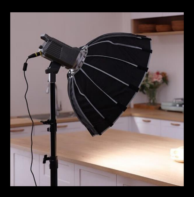
XX Brand 200W---Separated Power Design

Hard to control on high stands Adapter becomes burden