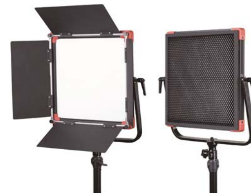
LA-HE60 4-leaf metal barn door