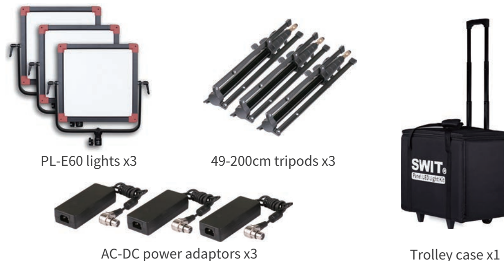
PL-E60 lights x3