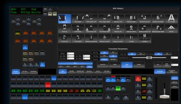
GRAPHITE CARBONITE GUI

Graphite contains Ross Video's most successful product of all time, the Carbonite Production Switcher. Enjoy the high-end production power of the world's most popular mid-sized switcher in this compact production system. For those not already familiar with Carbonite, key features include: