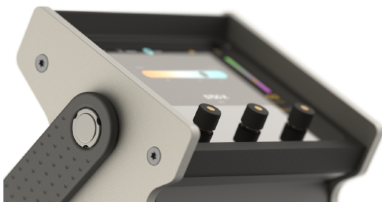
Illuminance (lux and fc)

FCC, CE, UKCA, IC, ROHS KC, NCC, PSE, BIS